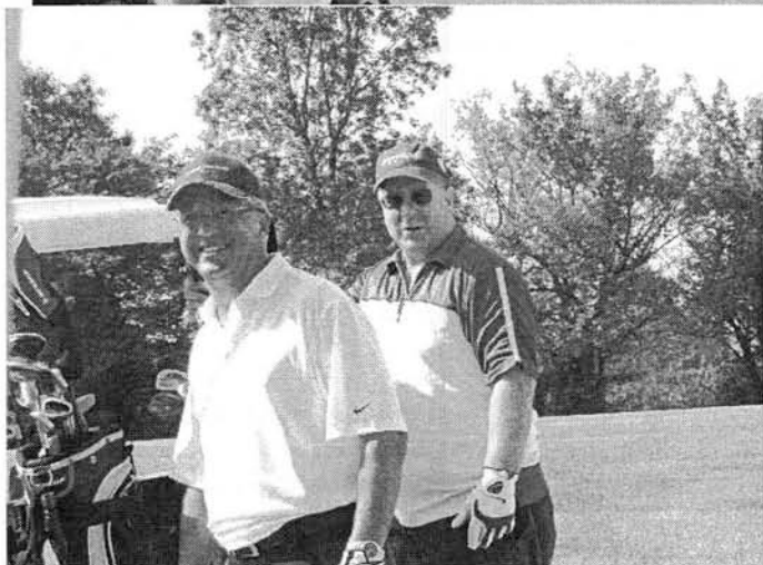
Having a good time at the ISA golf 2010 tournament at Moore town Golf Club. The weather was perfect and the camaraderie was enjoyable.