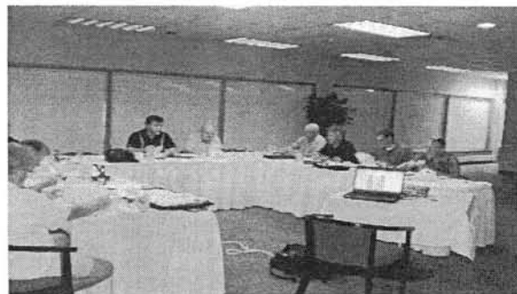
The executive at work !!!