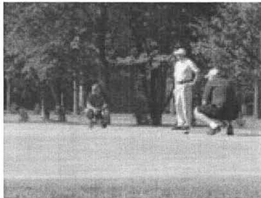
"Did you see that grass growing... while we wait for you?"