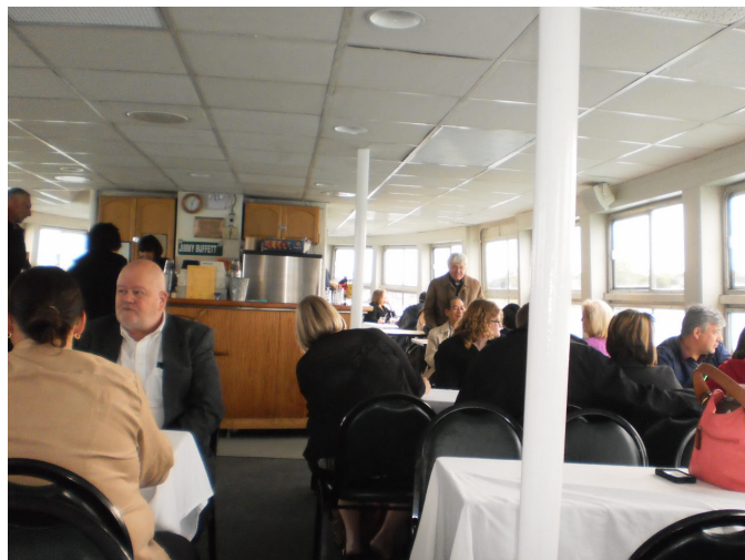
Are we having fun!!!! Oh no ! Some one is seasick