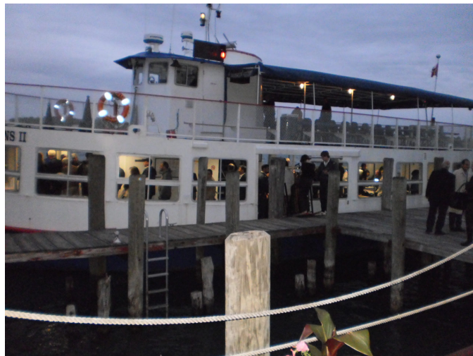
All Aboard or be left behind

General meeting last Monday in January, March, May, September, November