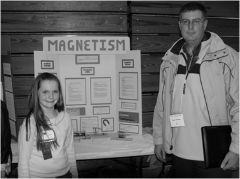
Magnetism - Junior Category 2nd Place