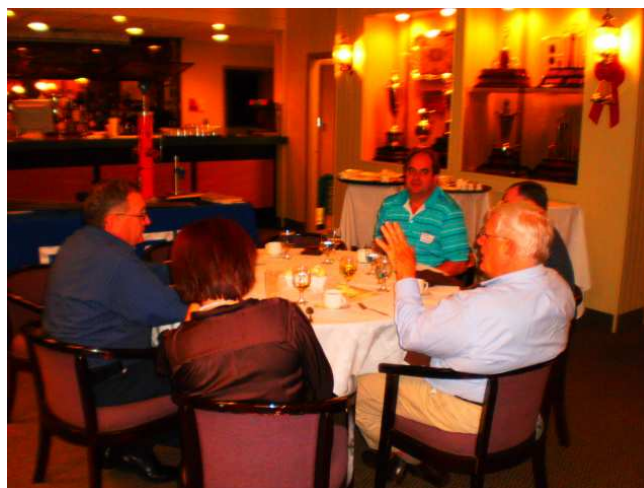
A very serious discussion ! What is it?